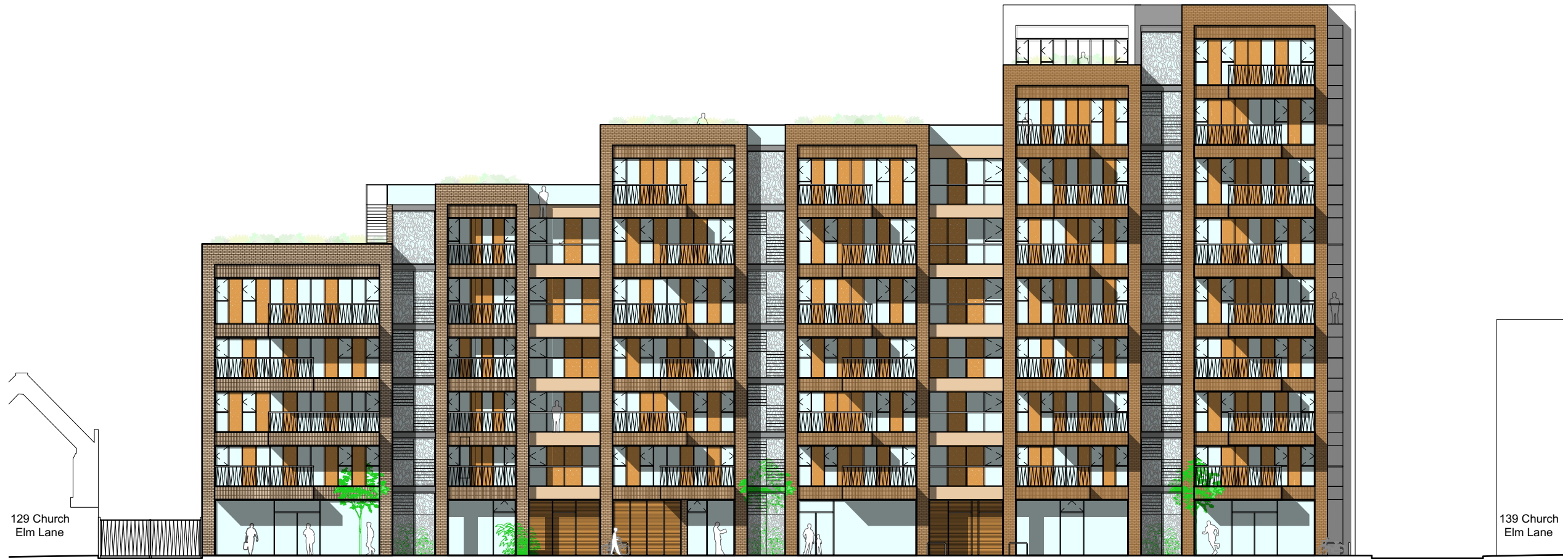
A: FRONT ELEVATION - SOUTH