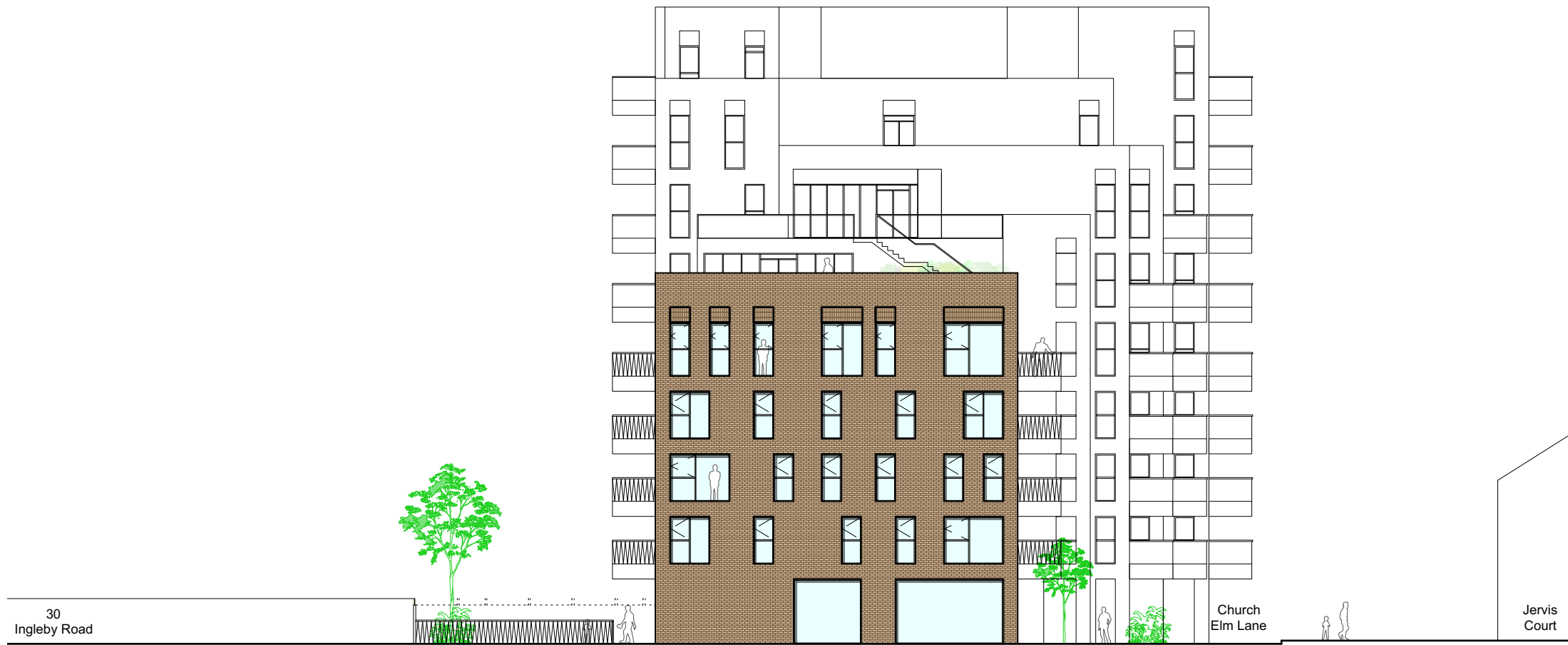
D: SIDE ELEVATION - WEST