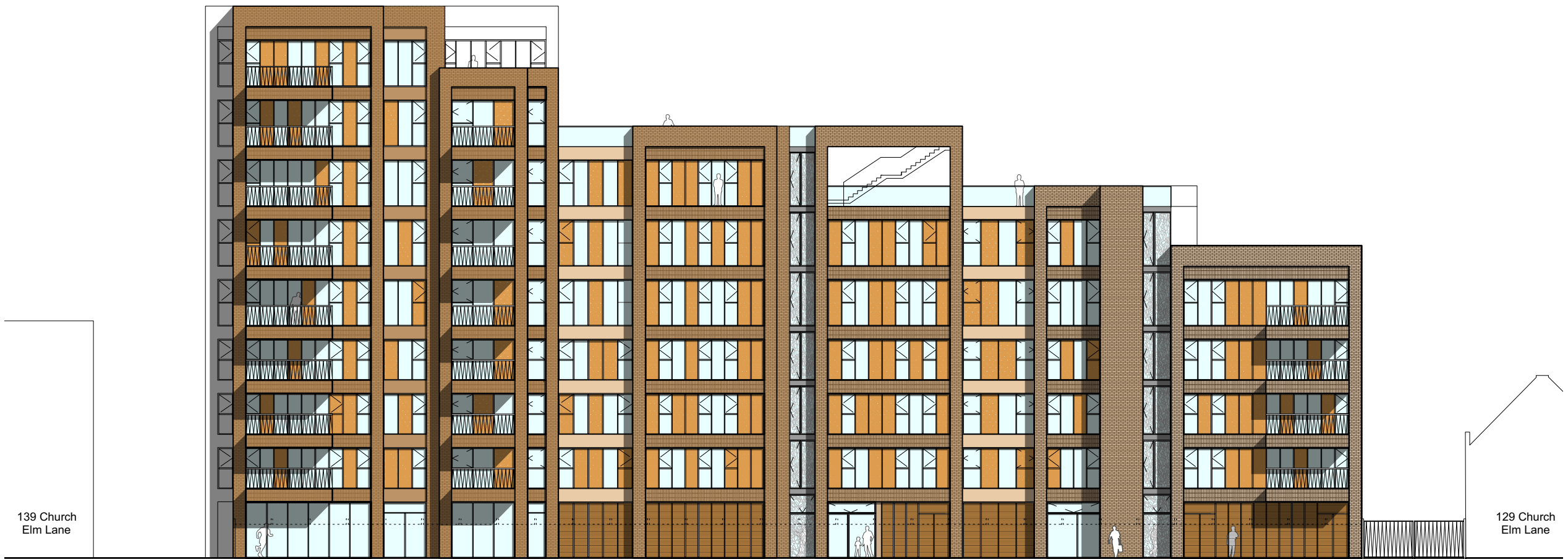
B: REAR ELEVATION - NORTH