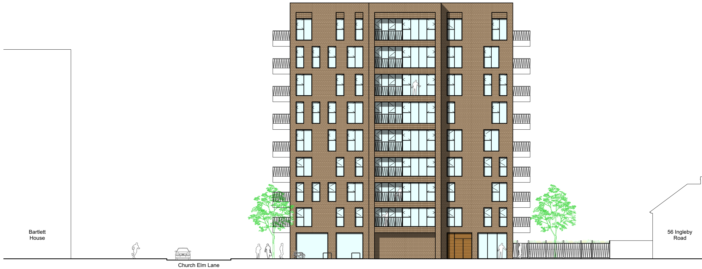
C: SIDE ELEVATION - EAST