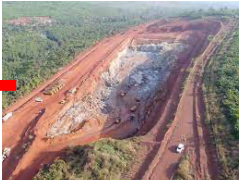
Bauxite mine for producing virgin aluminium. Mining like this produces significant carbon emissions. See Section 6.1.7 below