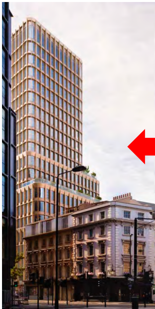
Proposed anodised aluminium facade

unnecessary waste. This is in direct opposition to Camden's Climate emergency declaration and associated carbon policies.