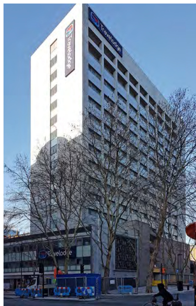
The existing Selkirk House, 1 Museum Street. A robust and substantial structure capable of beneficial reuse and repurposing, thus avoiding the demolition that would contribute to the climate crisis.

3.3. The existing Selkirk House is a substantial and robust structure that in the context of the climate crisis should not be seen as beyond economic reuse. The existing building/structure should be comprehensively explored as to how it can be reused and remodelled. The West End of London has some of the highest real estate values on the planet, it must therefore be possible to find an environmentally effective solution to this site that is also economically viable. This may not produce the maximum profit that the demolition/new build might produce, but it will be more appropriate in respect of UK, GLA and Camden policies.